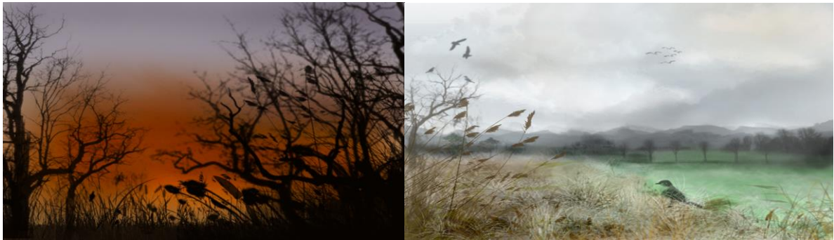
(left) Sample student designs and (right) Digital photo taken with a digital brush both made with the Photoshop CS6 application