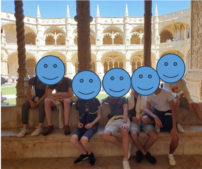
Mosteiro dos Jerónimos