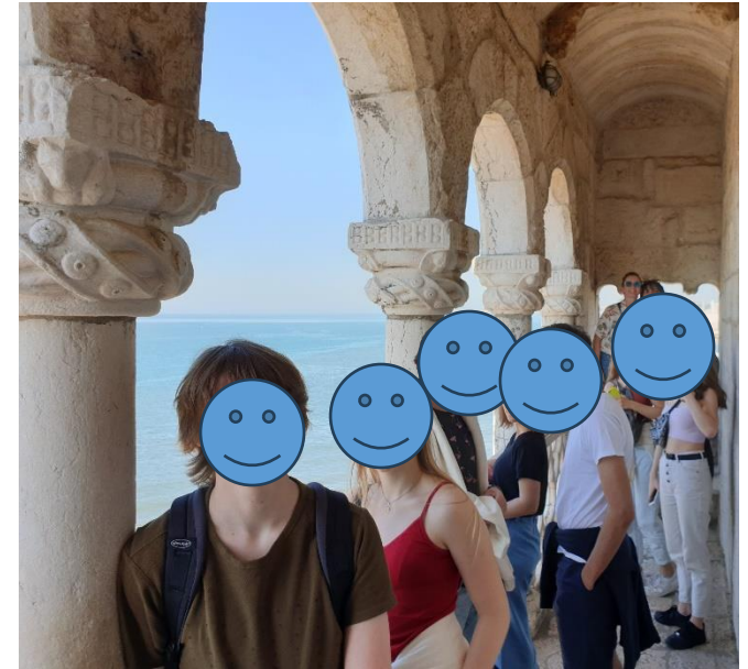
Torre de Belém