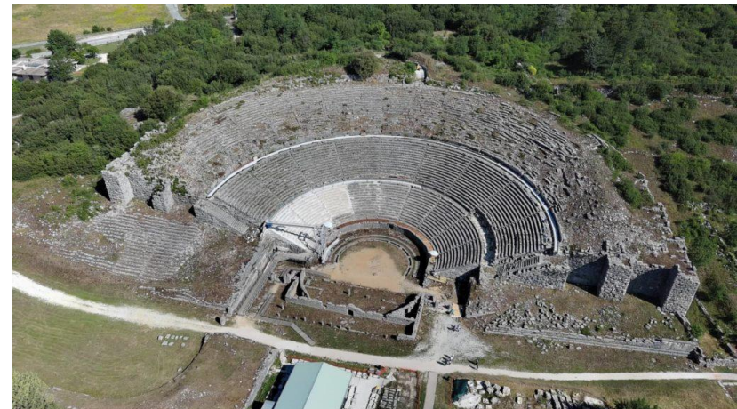
Dodoni Archaeological site